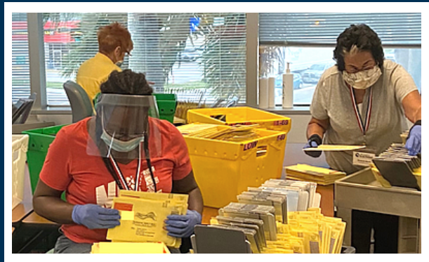
Election Support Staff sort returned Vote-by-Mail ballots by precinct.