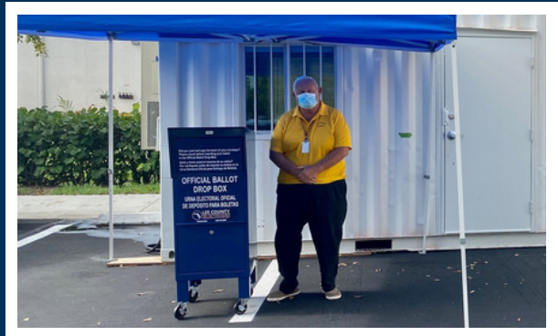
A secure Drive-up Vote-by-Mail Ballot Drop Box located at the Lee County Elections Center Early Voting site.