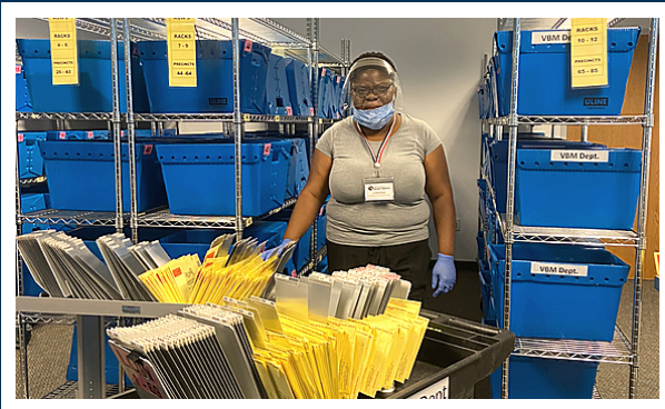
Sorted Vote-by-Mail ballots are stored by precinct in a secure vault room before tabulation begins.